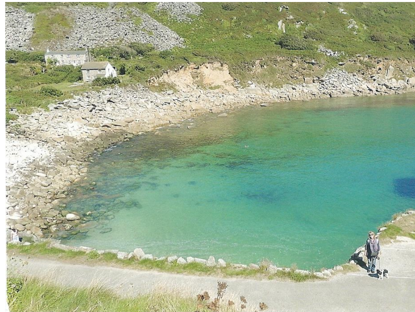
"...Highlights - Lamorna Cove."