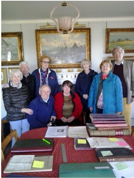
"...Wheal Betsy - owners' hospitality and knowledge and amazing collection of paintings."