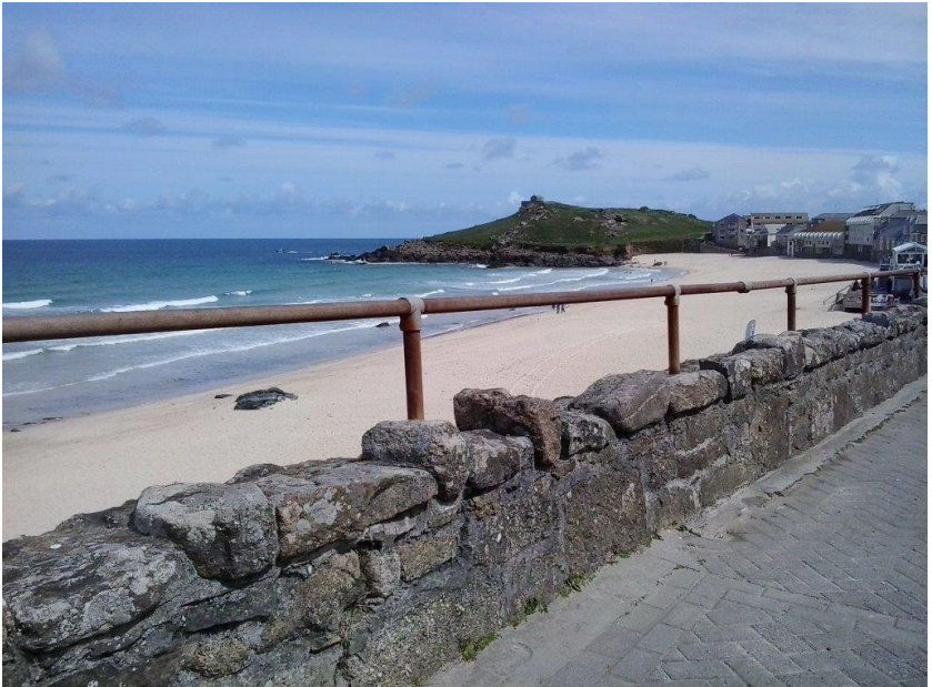
"...Highlights - the walk in Lamorna. Overall a really good time, meeting some nice people."