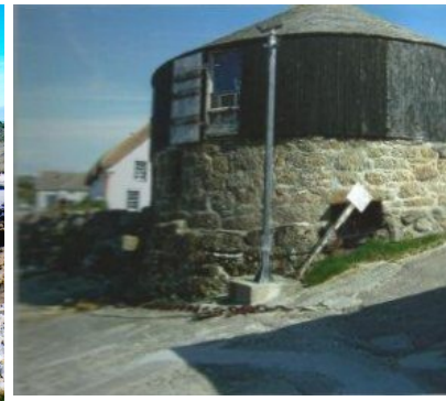
Zennor tin museum unfortunately closed