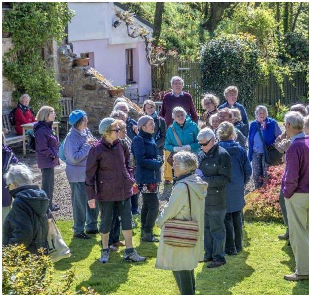
"...Not having visited the area before I was so enchanted by