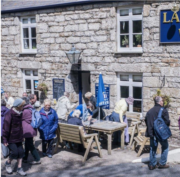
Alfred Munning's house in Lamorna, the walk and the rich, green landscape"