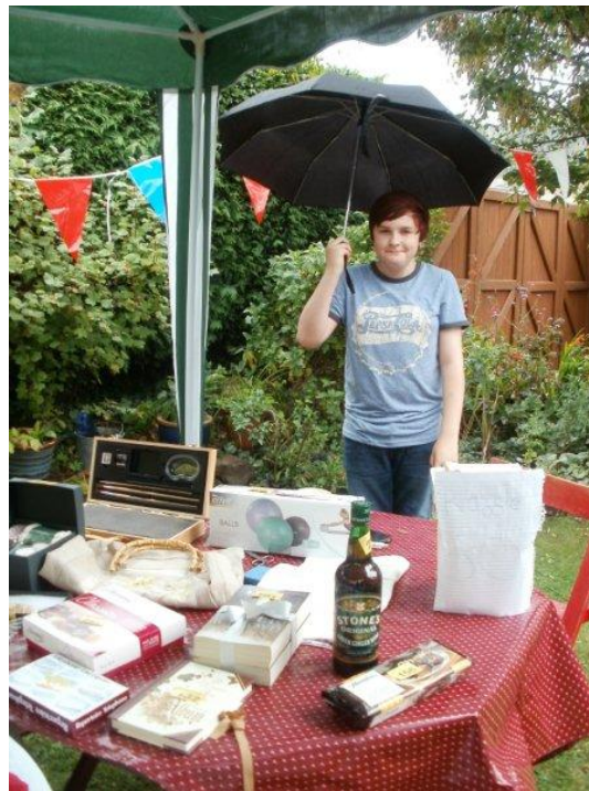
Roll up, Roll up for the raffle prizes