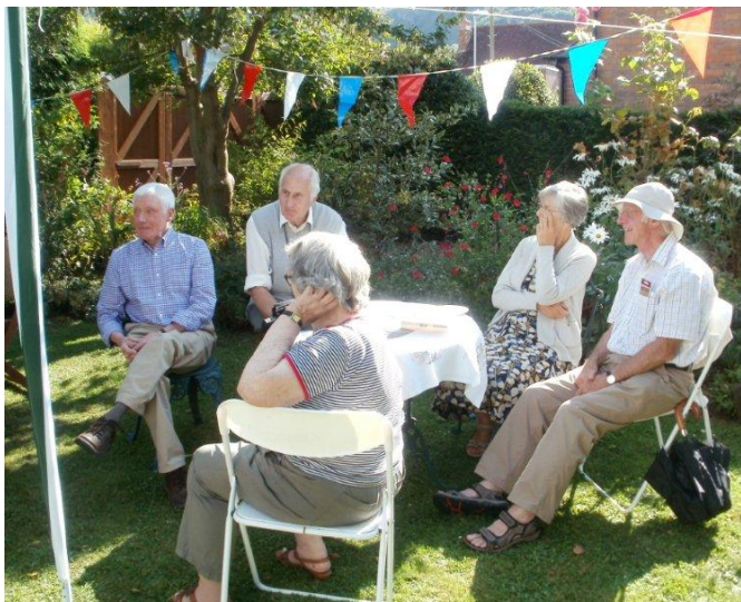
Eyes left, for the answers to the Quiz