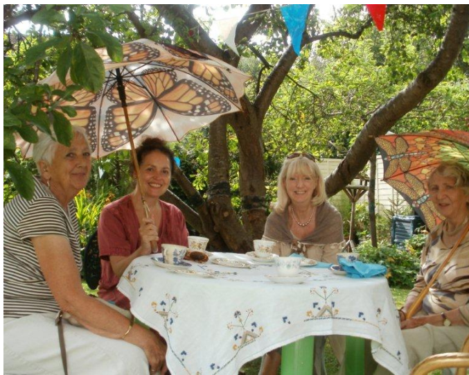
Magic moments under the sunshades