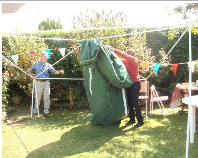
Helpers - all hands to the deck, with these "simple instructions"

Here are a few of the pictures - click photo(s) to enlarge view