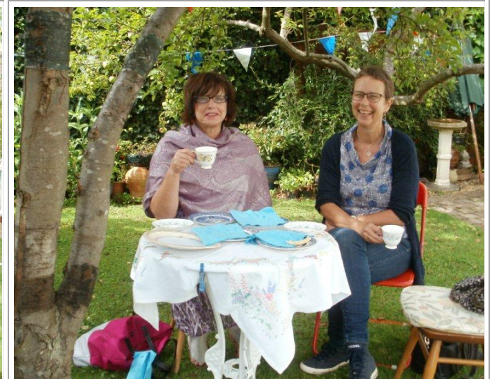
This afternoon Tea is amazing