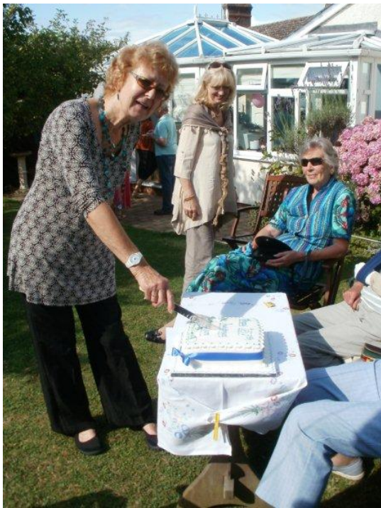
It's a shame to have to eat the cake, but it was yummy.