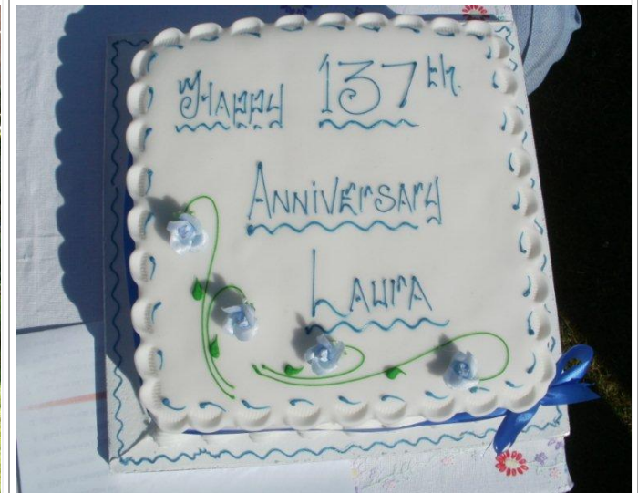
Voilà le gâteau