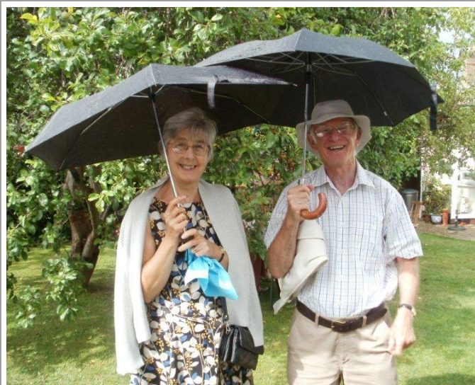
After short showers, the sun came out to make us smile.