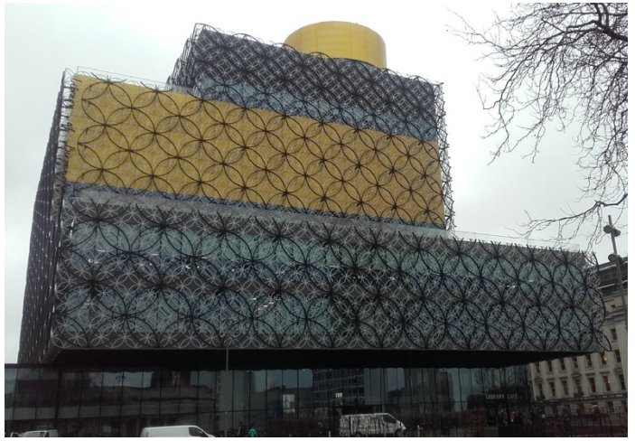
and in with the new. (part of the redevelopment of the area.)