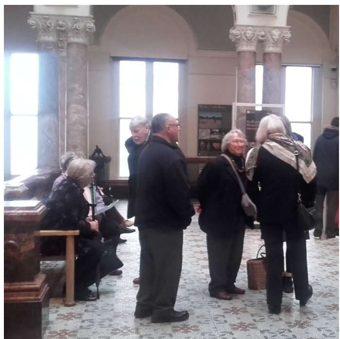
Some of our members at the gallery, waiting to visit the archives.

The damp of the morning was quickly dispelled during the comfortable journey to the Gallery.