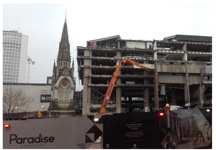
Out with the old Library