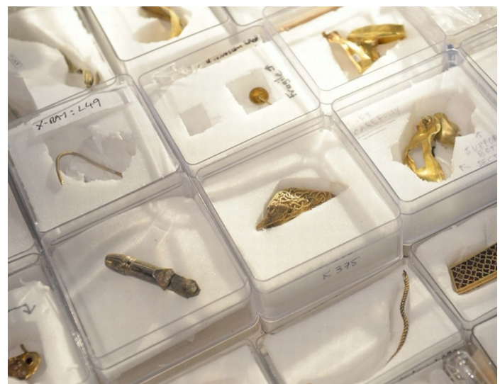
The Staffordshire Hoard at Birmingham Museum and Art Gallery,