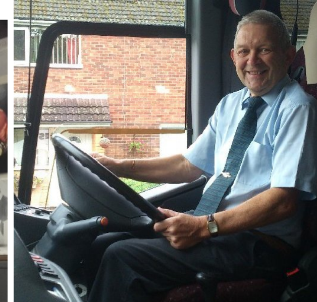
Time for home - courtesy of lan from Commandery Coaches