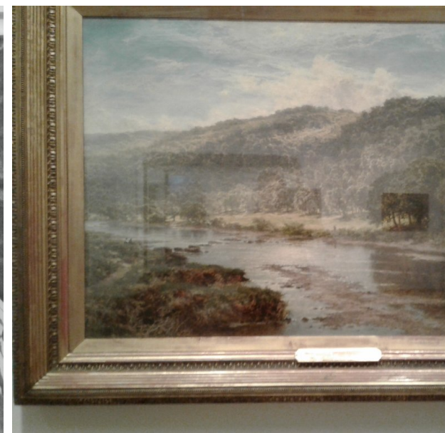
Benjamin Williams Leader RA 1831 - 1923 On the Llugwy below Capel Curig