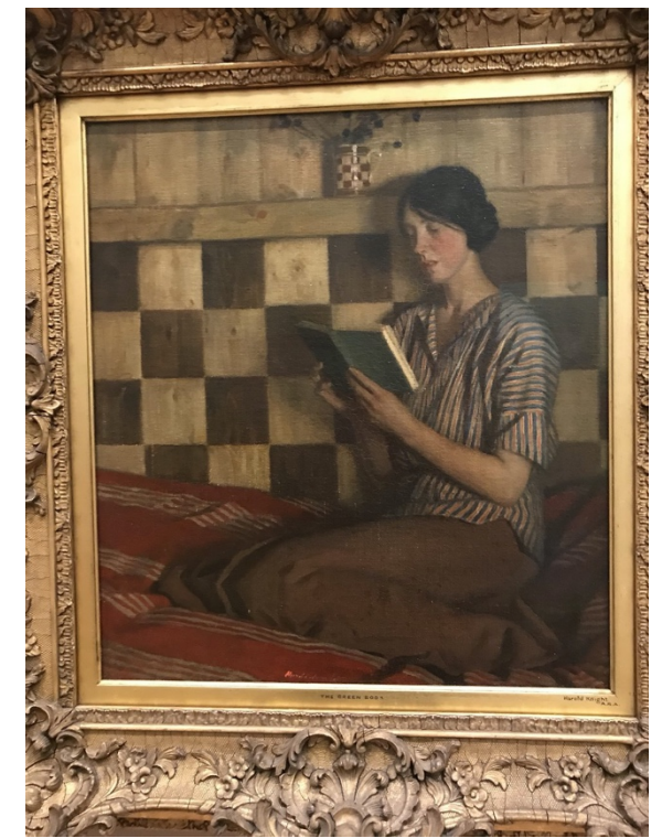
* Harold Knight RA 1874 - 1961 The Green Book