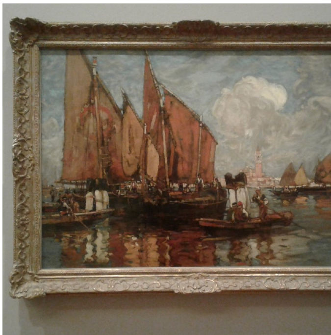
Frank Brangwyn RA RWS RBA 1867 - 1957 Venice: St Mark's from the Lagoon

For the rest of our visit we spent time in other Rooms discovering a wealth of ceramics, sculpture, silver and modern painting. Welcome respite came in the cafeteria with coffee and bara brith and the museum shop was a source of aesthetic bargains. Later some had time to explore the ambience and retail opportunities of the City whilst others sat 'people watching' in the beautiful civic gardens, enjoying an ice cream.