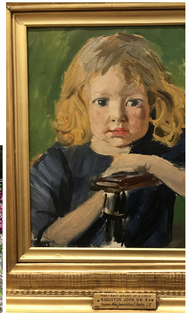
Augustus John OM RA 1878 – 1961 Portrait of a Child