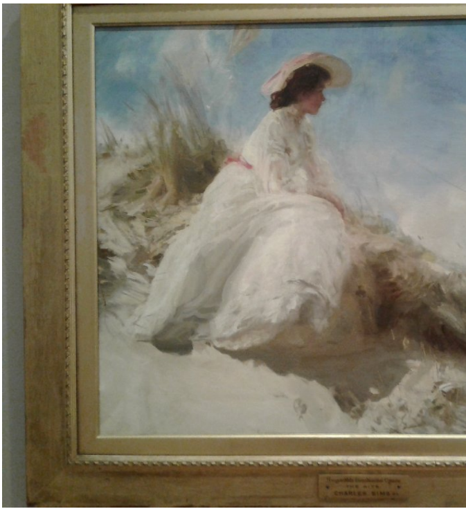
Charles Sims RA 1873 - 1928 The Kite