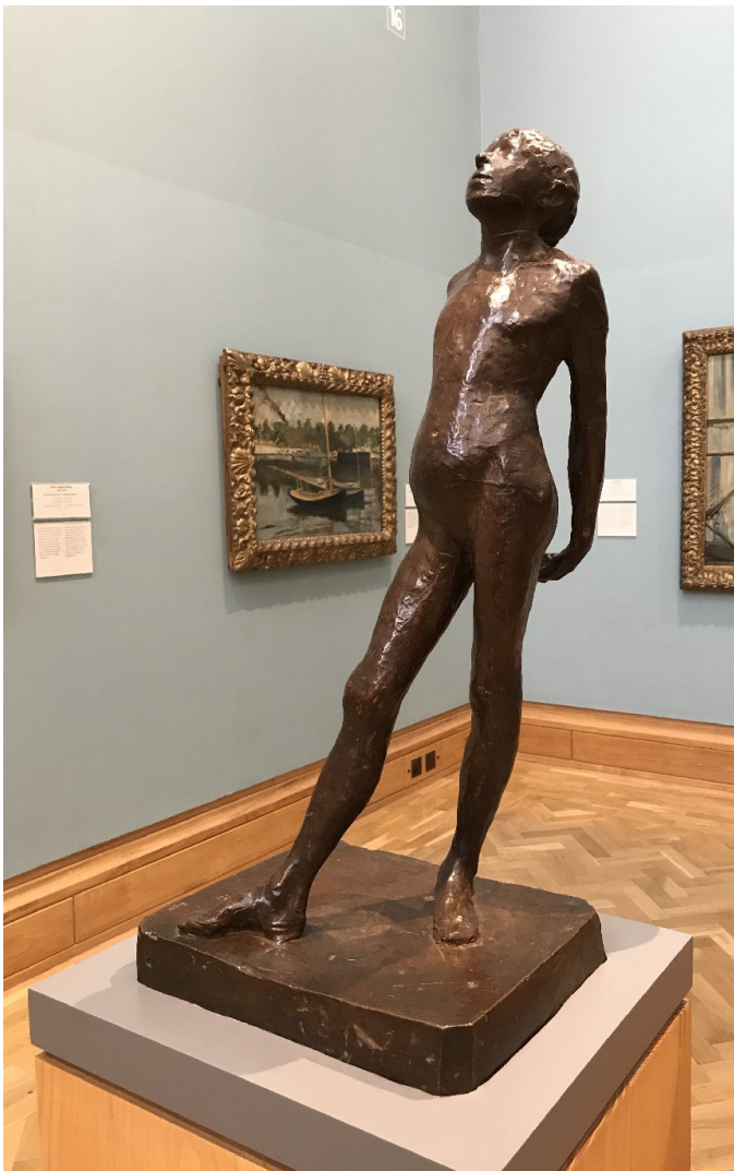
Edgar Degas 1834 - 1917 Bronze, Nude Little Dancer