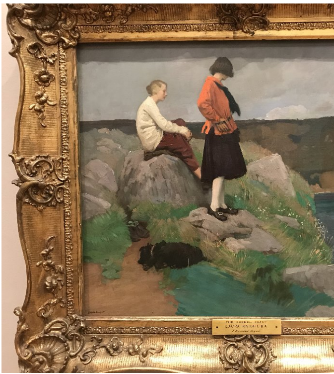
* Dame Laura Knight DBE RA RWS 1877 – 1970 The Cornish Coast

Out of 6 owned by Cardiff we only had the opportunity to view 2 of the Knights' works on display - see images *.