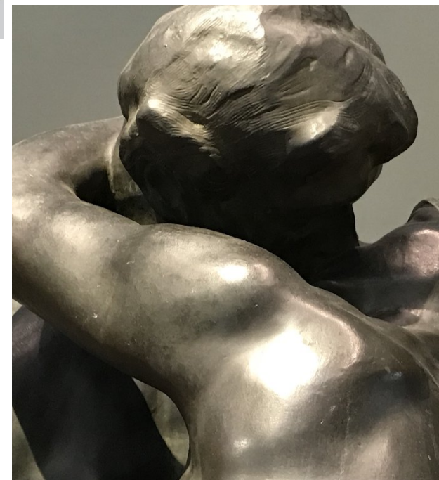
Auguste Rodin 1840 - 1917 The Kiss