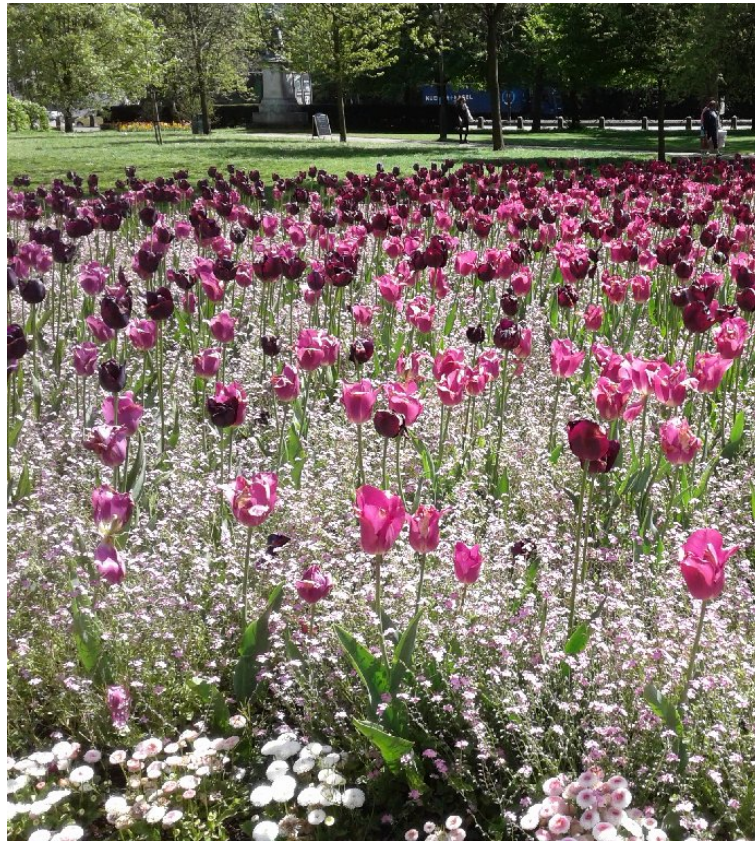
last view of the Civic gardens, as we left .