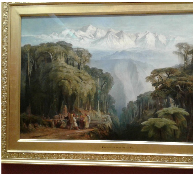
Edward Lear 1812 - 1888 Kinchinjunga from Darjeeling