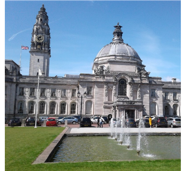
View from the Civic gardens

Much of the modern collection had been given to