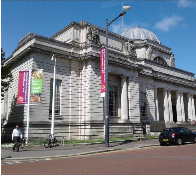
Cardiff National Museum

Vivid memories of Cardiff: (click image(s) to enlarge view)